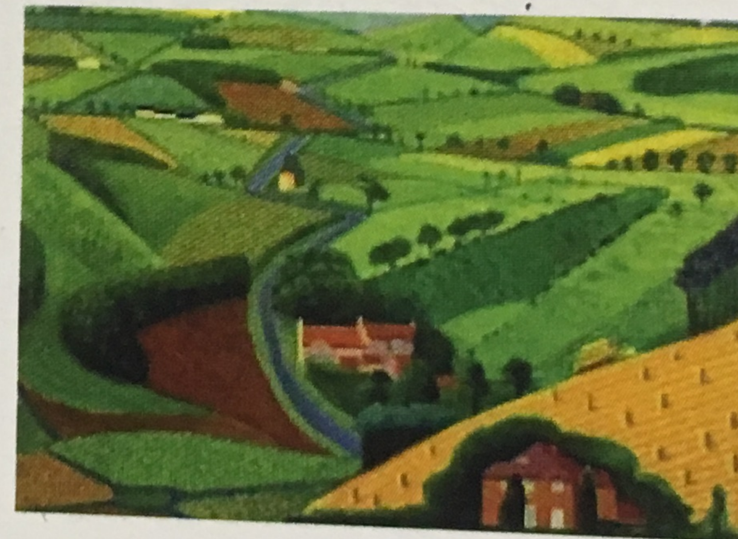
David Hockney to get retrospective at Tate Britain next year