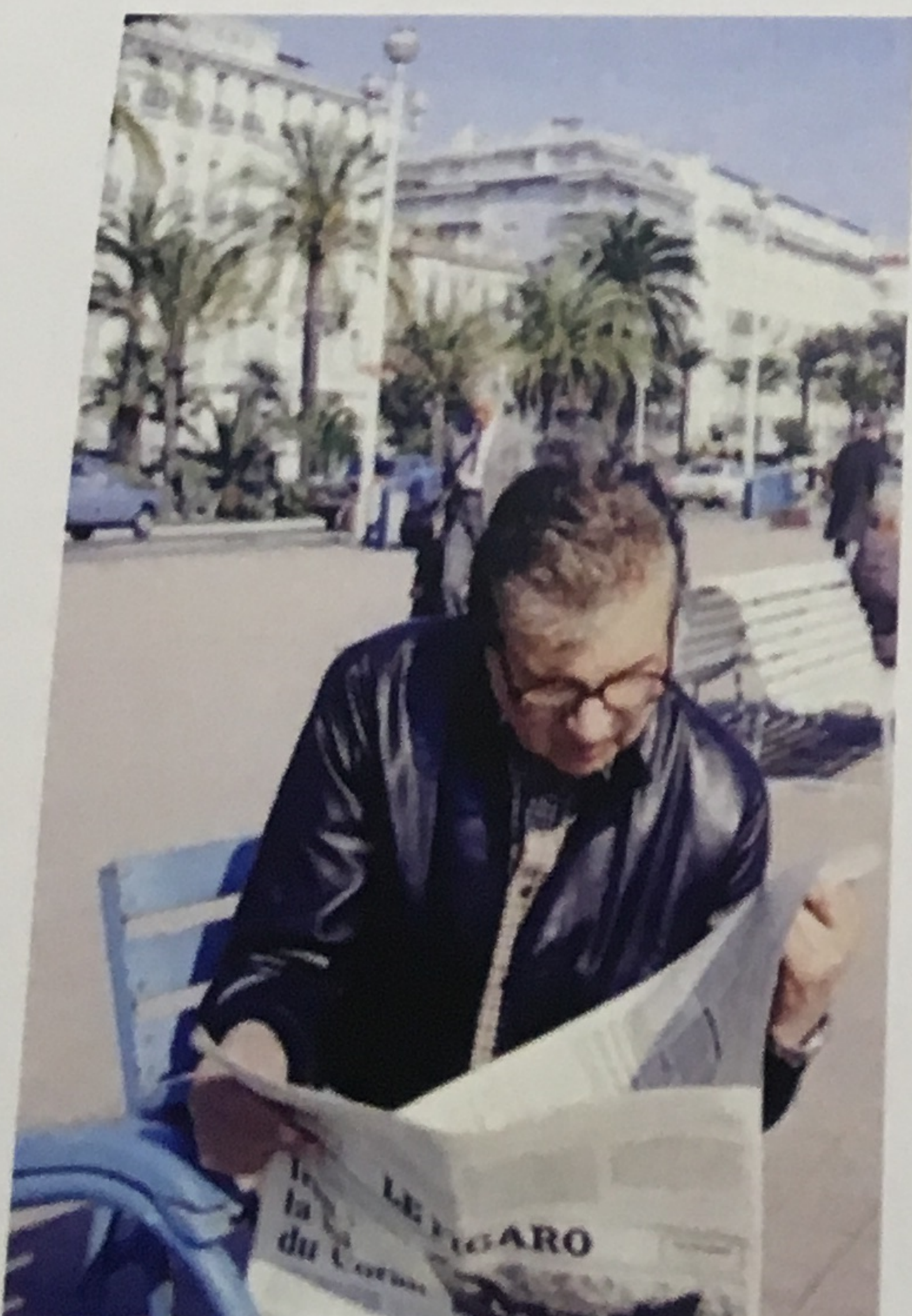
Francis Bacon in Nice, March 1979

Boustany bought Bacon's first work, entitled Watercolour (1929), after it sold at Christie's in 2013 for £183,000. It was painted just after Bacon's return to London from Berlin. The picture was first owned by Eric Allden, Bacon's probable lover at the time.