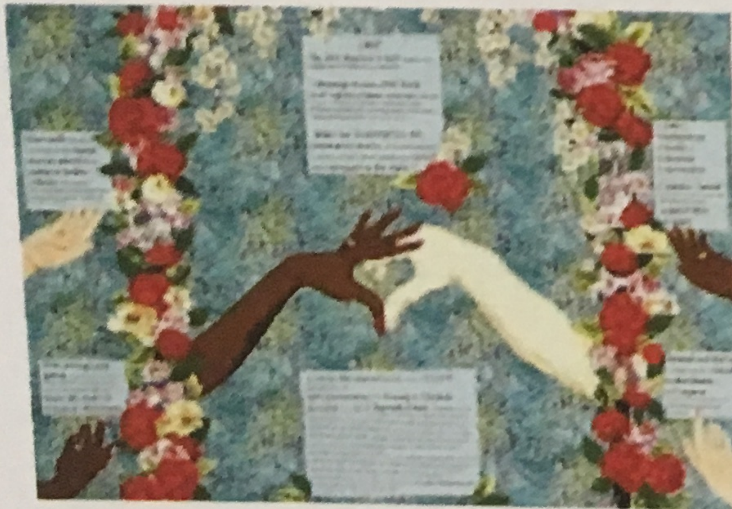
A timeline of African American history, told through quilts